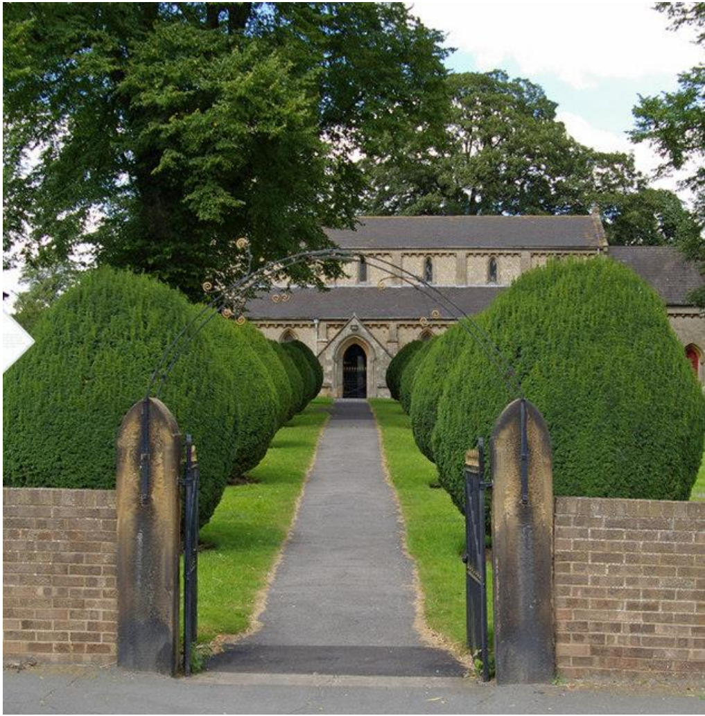
St. Hybald, Scawby