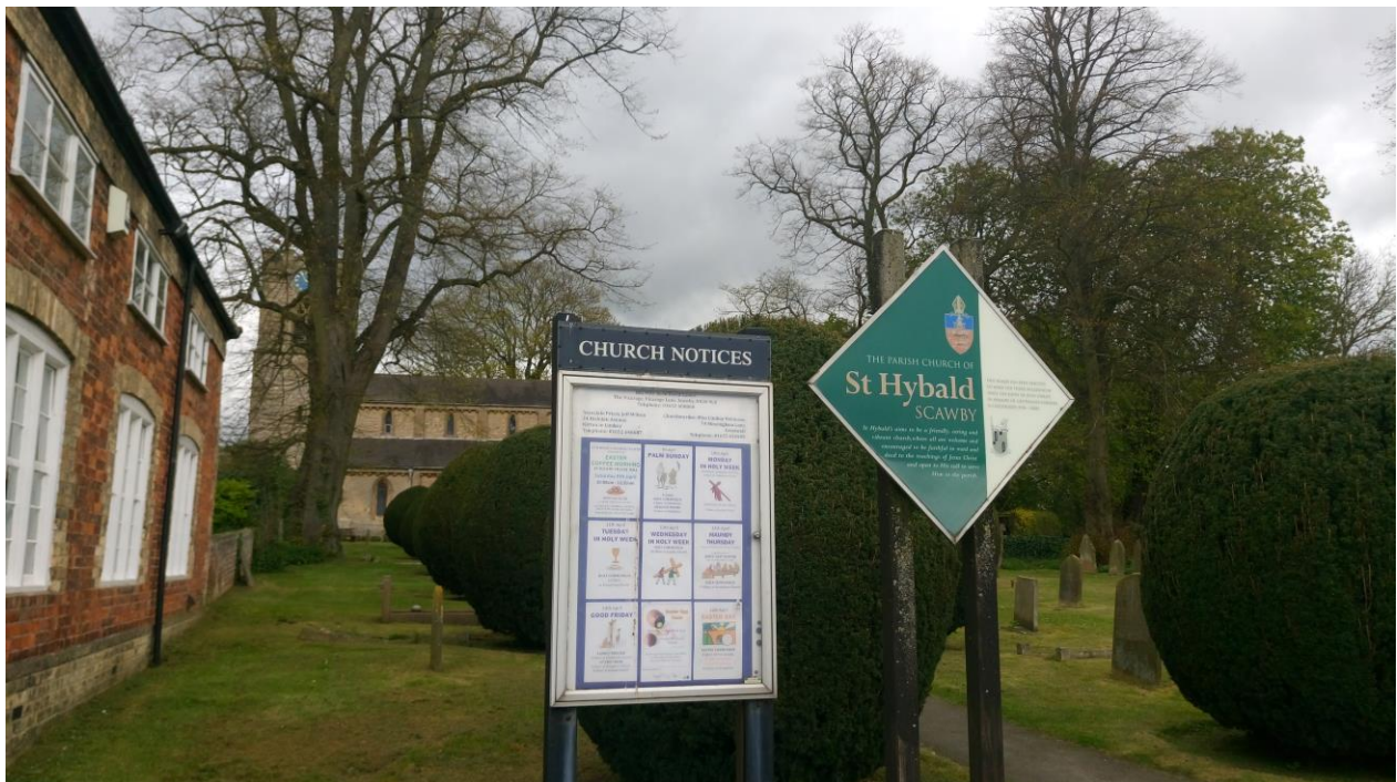
St. Hybald, Scawby

St. Hybald Churchyard, Scawby, Lincolnshire contains only 1 Commonwealth War Grave.