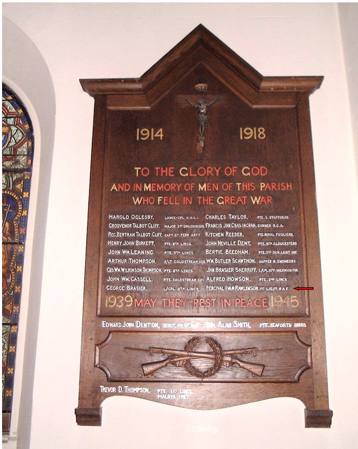
Men of Scawby Parish Roll of Honour